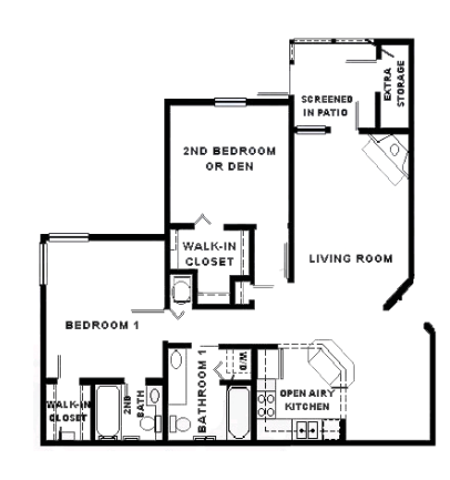
Floor Plan 2.1 2 bedrooms 2 bath